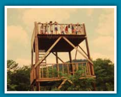
CAMP GRIER MINISTRY