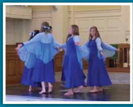
VITAL CHURCHES MINISTRY